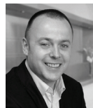
United Kingdom Peter Farrelly