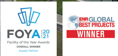
Janssen Sciences Ireland UC, Ireland Bulk Drug Substance Facility