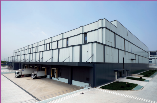
Merck, China OSD Manufacturing, Packaging and Logistics Facility