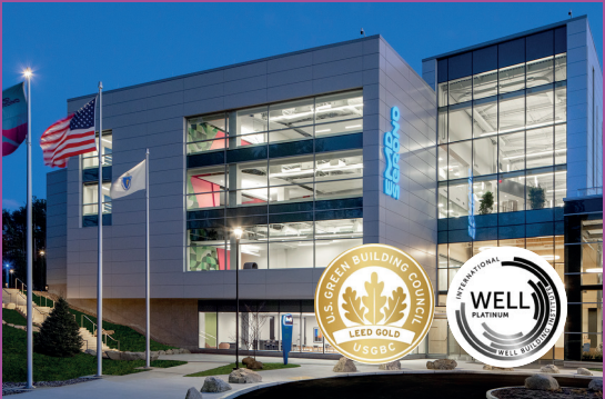
EMD Serono, USA R&D Laboratory & Office Facility