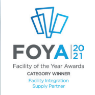
Takeda, Ireland High Containment API and DP Facility