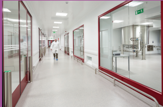
Sanofi (formerly Genzyme), Belgium Bulk Biologics Facility