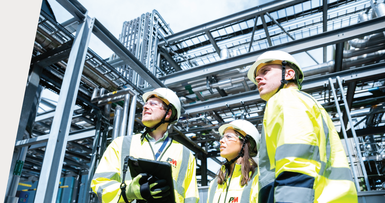
Pressure Relief Design & Evaluation